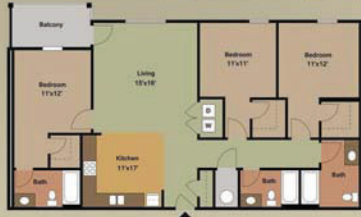
3 Bedroom 3 Bath