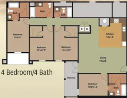
4 Bedroom/4 Bath