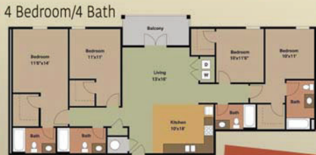
4 Bedroom/4 Bath