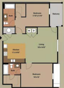
2 Bedroom 2 Bath