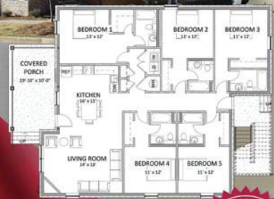
5 Bedroom/5 Bath

Times Square represents the newest, nicest walkable community offered by College Station Properties, a locally owned and managed company that has a long history of offering exceptional quality residential offerings and service. Times Square offers three, four and five bedroom units; each with its own private bathroom. These homes will provide the highest and best quality, location and value. Times Square is an easy walk to class or to sorority houses, as well as entertainment venues and athletic events. These homes will not last long and will be the very first to lease year end and year out. Come and see Times Square, in person or virtually by contacting College Station properties.